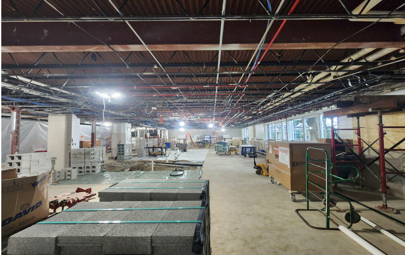
Elk Grove High School – Culinary Classroom