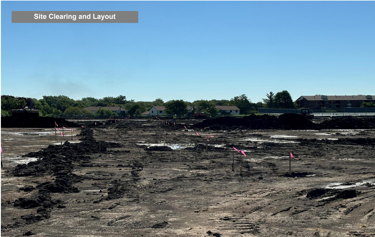
Buffalo Grove High School – Ballfield Replacement Phase 1