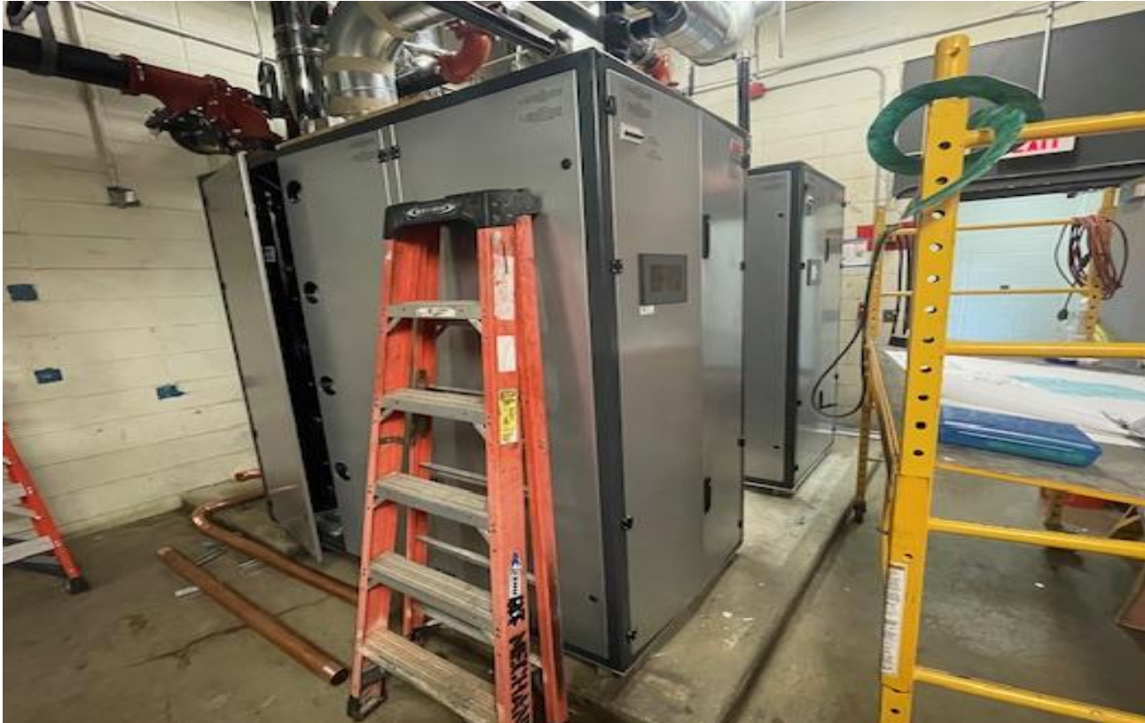
Buffalo Grove High School – Boiler Replacement