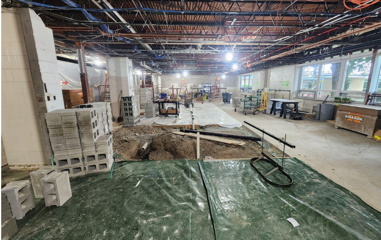
Elk Grove High School – Culinary Classroom