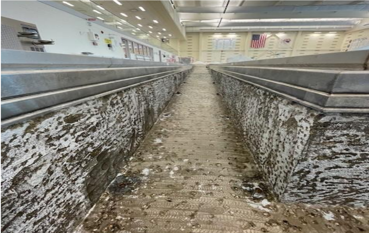
Prospect High School – Pool Plaster Replacement