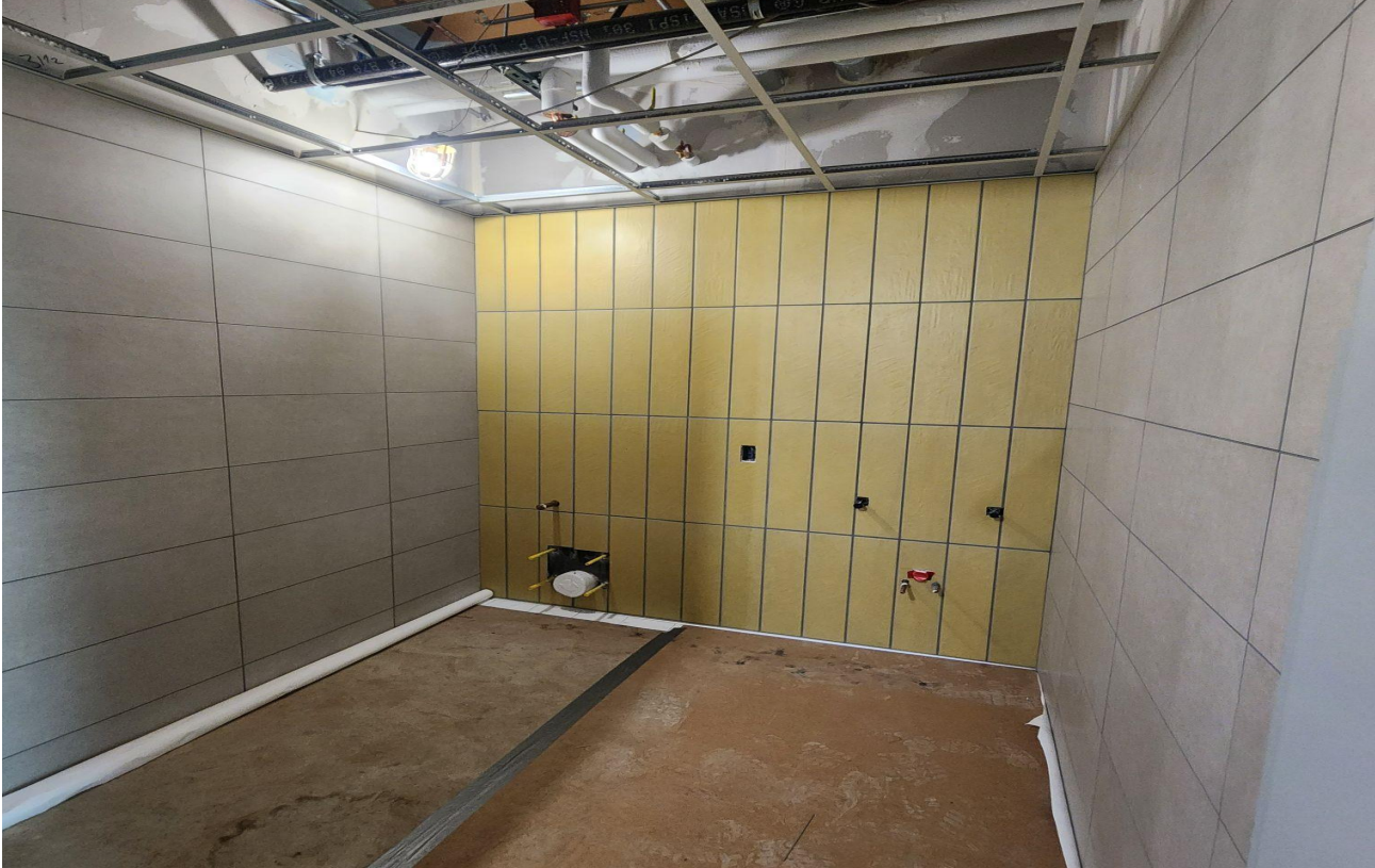
Elk Grove High School – Student Services