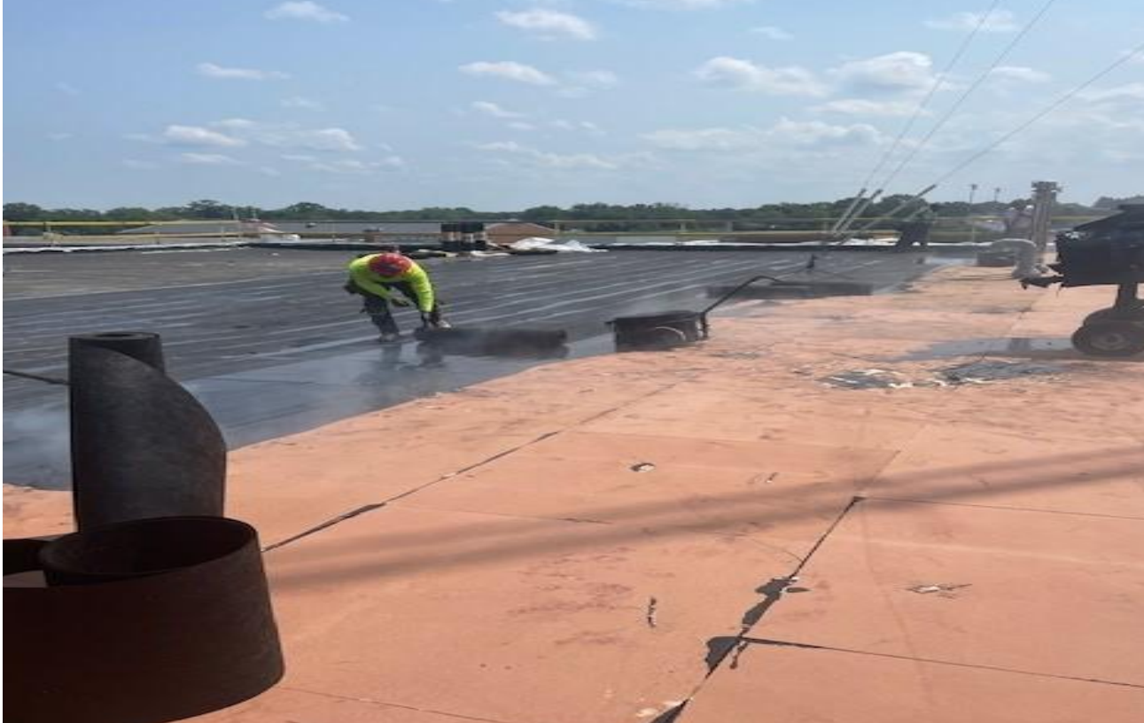
Prospect High School - Roof Replacement