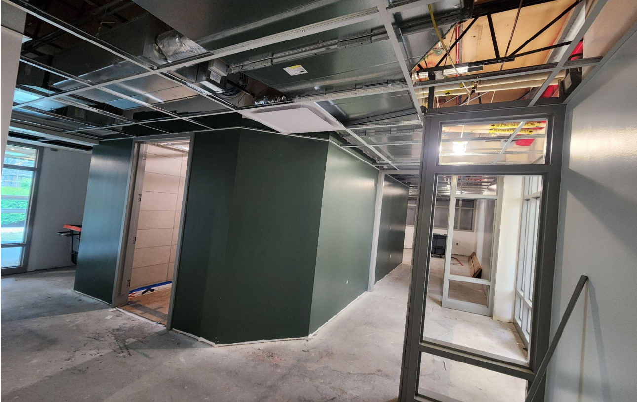
Elk Grove High School – Student Services