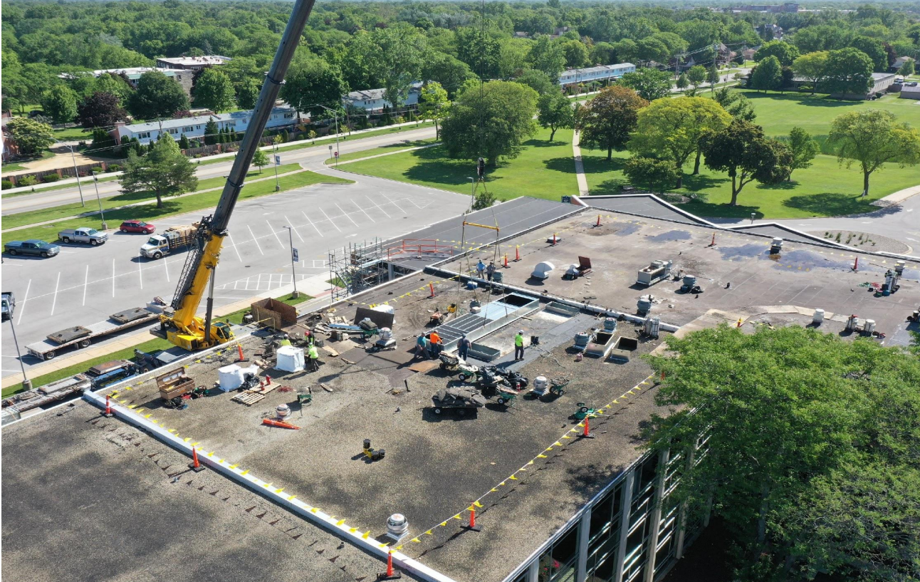
Prospect High School – Roof Replacement