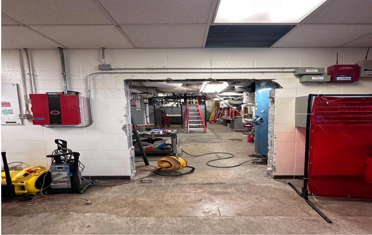
Buffalo Grove High School – Boiler Replacement