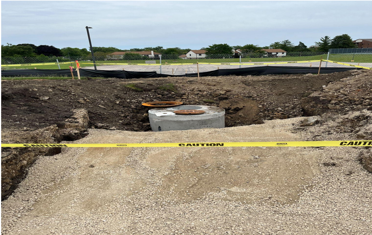
Buffalo Grove High School – Ballfield Replacement Phase 1