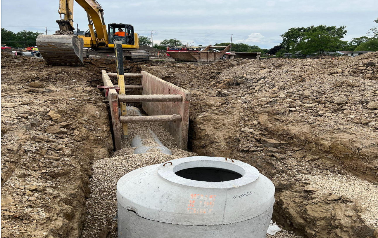
Buffalo Grove High School – Ballfield Replacement Phase 1