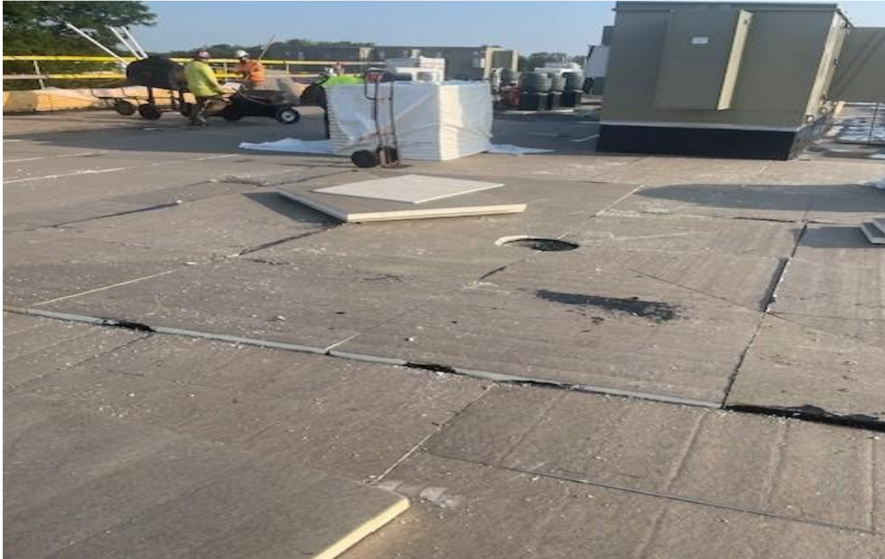
Prospect High School – Roof Replacement