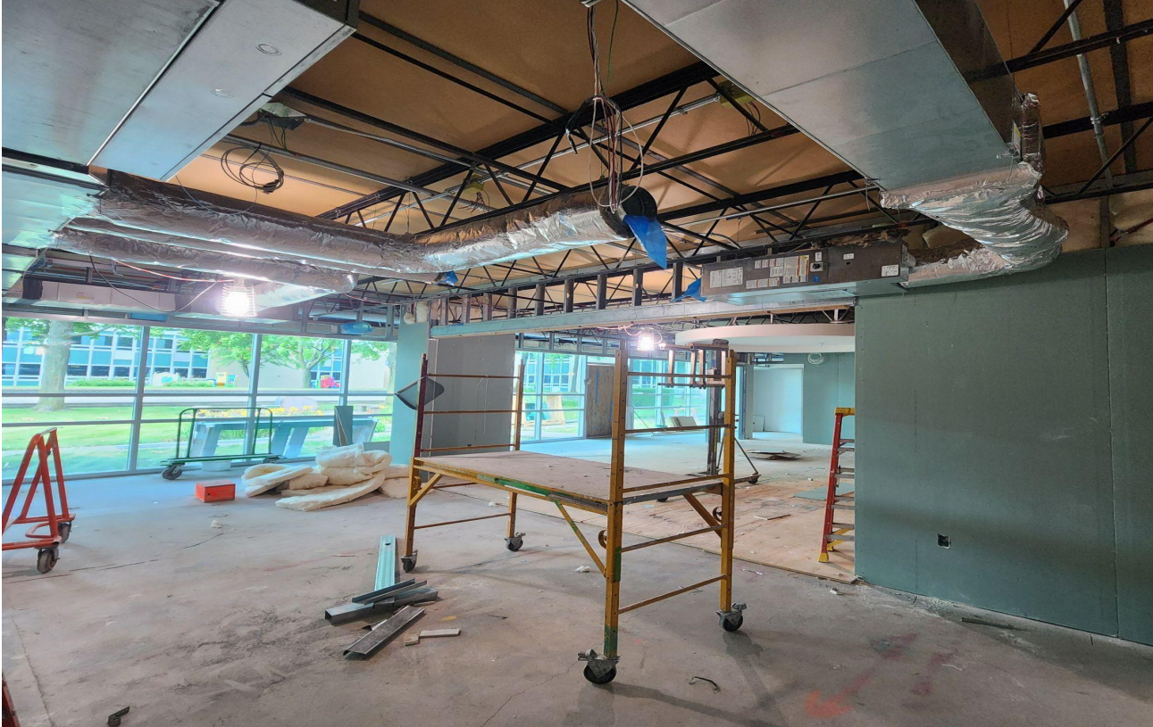
Elk Grove High School – Student Services