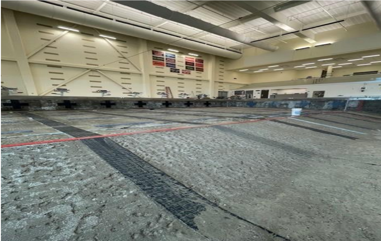
Prospect High School – Pool Plaster Replacement